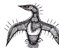
Peter Gzowski College